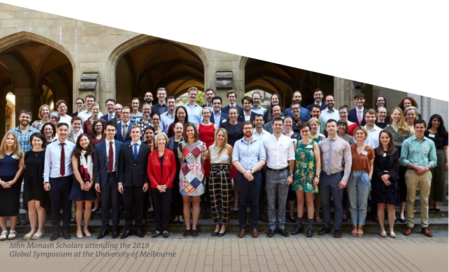
John Monash Scholars attending the 2019 Global Symposium at the University of Melbourne